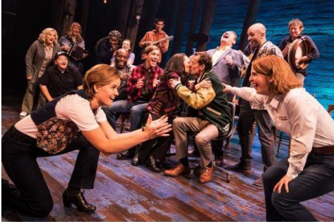
First North American Tour of COME FROM AWAY Pictured: The First North American Tour Company of COME FROM AWAY

ON 9/11, the world stopped. On 9/12, their stories moved us all.